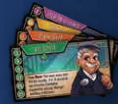
14 Reference Cards