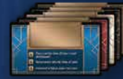
5 Player Color Cards