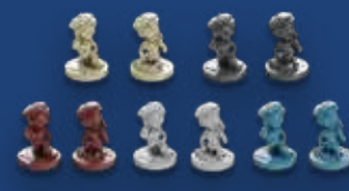
10 Workers (2 x 5 Colors)