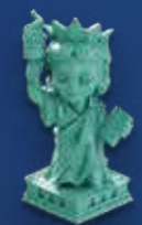
1 Statue of Liberty