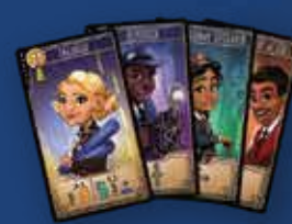
85 Role Cards